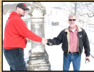
THE EDITURD & STONEY BEE

Well Brothers it's been another busy month here in the Northwest! The clampout was a great success, and everyone had a great time at the Wilkeson parade. Thanks again to everyone for there help and support. Without all of you doin' the stupid shit you do, we couldn't do this. Peace, love, and hair grease!